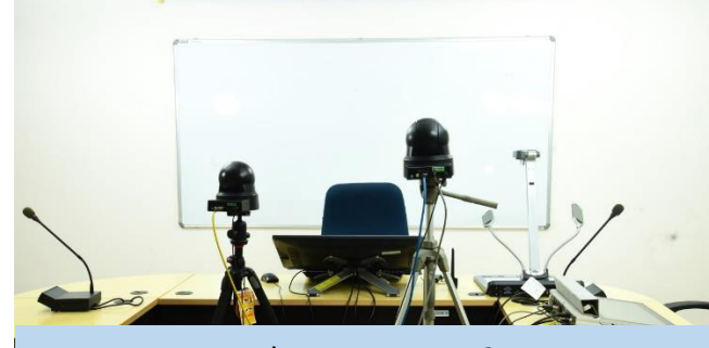
e-claassroom No. 2