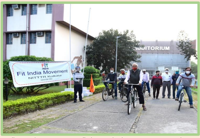
"Fit India Movement" the cyclothon program in the campus