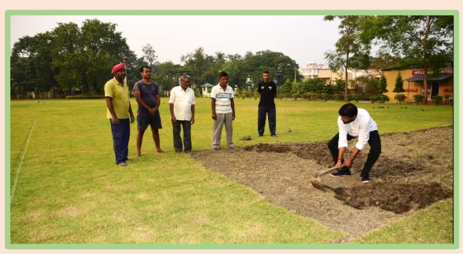
A learning —cum-doing exercise to the outsourced staff how to dig in the field